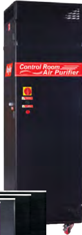
Control Room Air Purifier