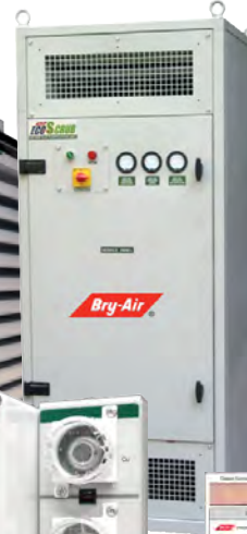
Thin Bed System