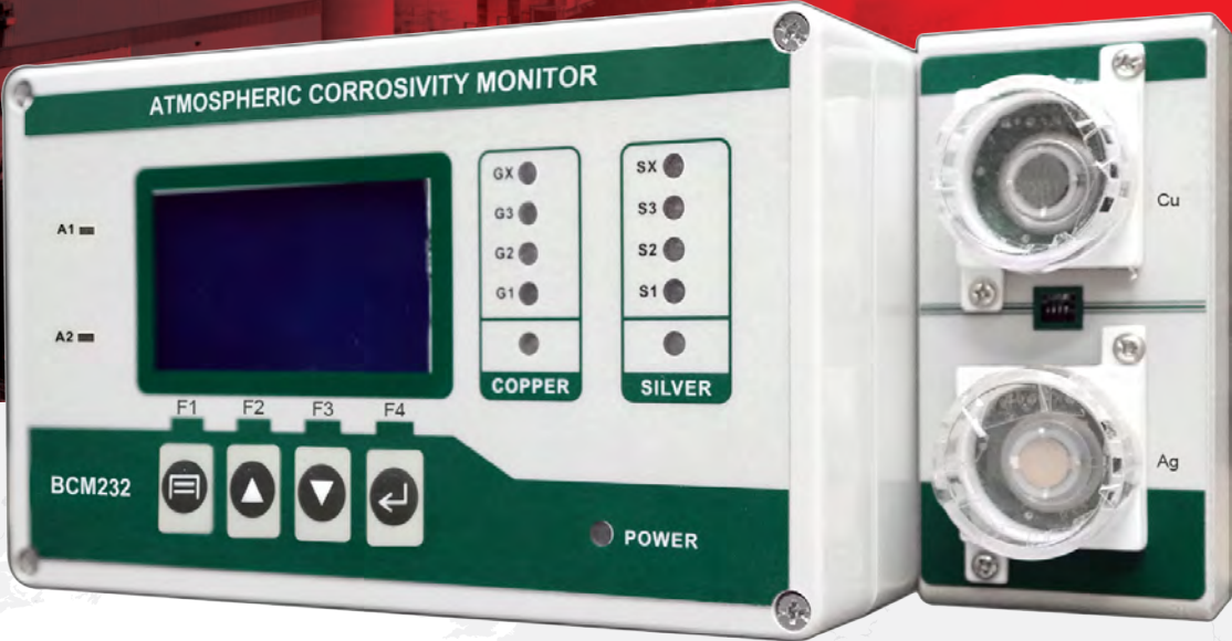
Atmospheric Corrosivity Monitor (ACM)