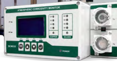
Atmospheric Corrosivity Monitor