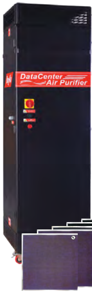
Honeycomb Chemical Filter - DRISORB™ series